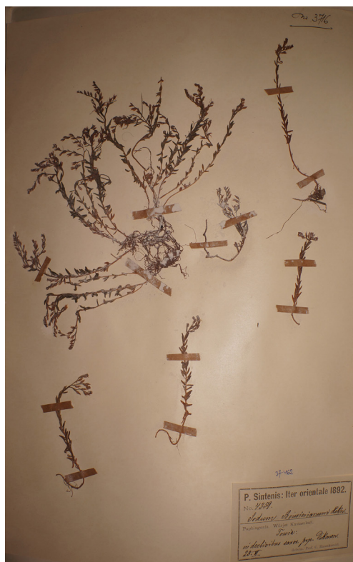
Figure 2 Herbarium sheet housed at BUCF with the gathering P. Sintenis: Iter Orientale 1892. No. 4359

Albeit Froederstroem synonymized S. boissierianum Hsknt with Sedum rubens L, he clearly recognized Haussknecht's paternity and priority over the binomial and its validity for the specimen depicted in the diagnostic drawings. The specimens on the herbarium sheet in LD177072 were initially examined and iden-