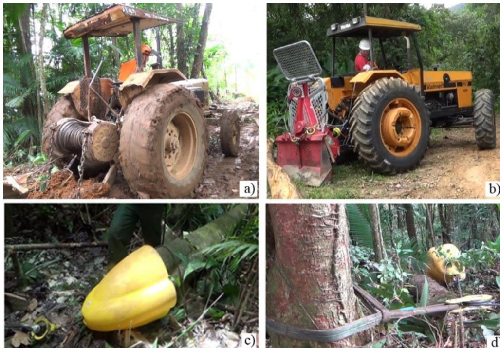
Figure 2 a) Tractor winch in the conventional method; b) Tractor winch in the alternative method; c) Skidding cone; d) Snatch block.

operator from the Amazon tropical high forest region. Although the operator was skilled in directional and reduced impact felling techniques, he had no experience working in secondary Atlantic Forest. Timber extraction was performed with a Valmet tractor model 128 (4x4, 94 kW) and a TAJFUN winch model EGV 85 AHK (Figure 2b) with a steel cable of 11 mm diameter and 80 m length, representing state of the art of PTO driven forestry winches. In contrast to the TMO winch, the TAJFUN winch was equipped with a fairlead, a winch blade and safety features such as cable guards. The tractor was operated by a professional tractor operator experienced in forest plantations, but with no experience in secondary Atlantic Forest or natural forest. Within both systems, an additional helper supported the operators to pull out the cable from the tractor winch to the log location inside the stand. A Portable Winch® skidding cone (Figure 2c) and a TAJ-