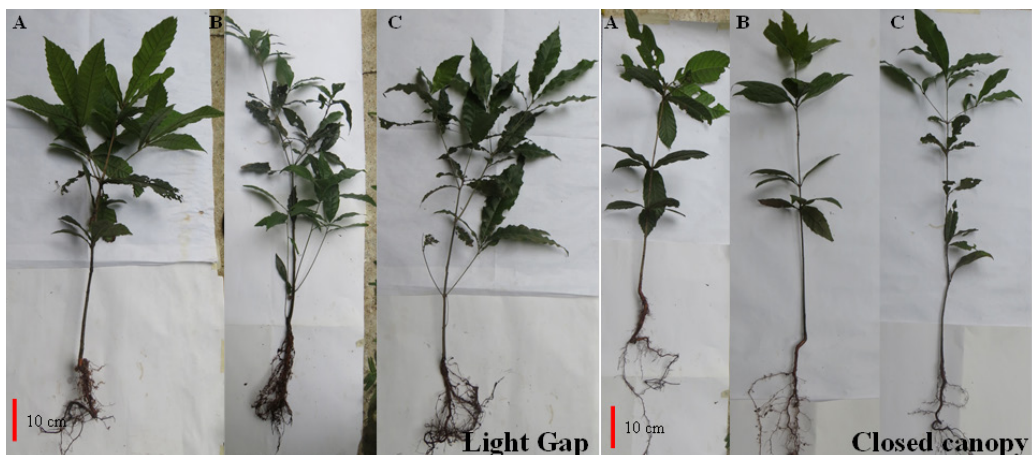
Figure 2 Representative images of 13 month old seedlings of A) Q. insignis , B) Q. sartorii and C) Q. xalapensis grown within light gap and a closed canopy conditions