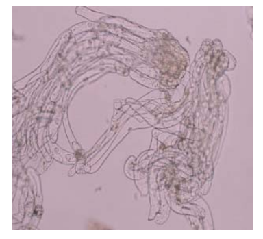
Figure 5 Suspension culture of somatic embryogenic cells of P. armandii var. amamiana

method so far was grafting the scion buds from in situ mother trees onto exotic five needle pine like Pinus strobus for establishing clone bank or seed orchard. However, it requires management of exotic pine rootstock is essential. In vitro culture methods will help propagate rootstocks for grafting on the same domestic pine species or seedlings from seed orchard. In vitro culture itself might be used as the ex situ conservation method in conjunction with cryopreservation.