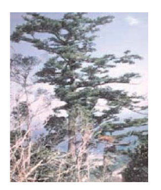
Figure 1 A survival tree of P. armandii var. amami ana in Yakushima Island

Mature and immature seeds were collected from early July to early September from the remaining trees of P. armandii var. amamiana in Yakushima Island. For separation of empty seeds caused by inbreeding depression, only submerged seeds in 100% ethanol were used for experiments in the case of mature seeds.