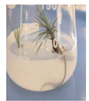
Figure 3 Root formation from shoots of P. armandii var. amamiana .

Embryogenic cell suspensions were induced better from immature seeds of P. armandii var. amamiana on modified MS (half strength in major elements and ammonium free) liquid medium supplemented with 3 \mu M 2, 4-D and 3 µM BAP (table 2). However, it seems that effects of plant growth regulator combinations were not so determinative because somatic embryogenic cells were also obtained in other combinations. Physiological and genetic state of immature embryos might be also important embryogenesis. for somatic Induced suspension cells were subcultured successfully every 2-3 weeks (fig. 5). There are many