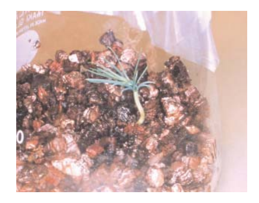
Figure 7 Regenerated plantlet of P. armandii var. amamiana from somatic embryo