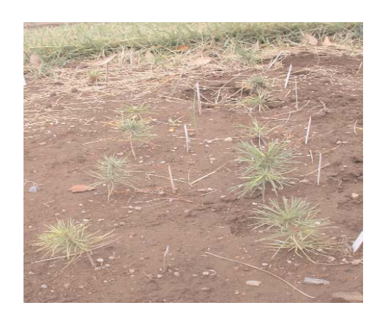
Figure 4 Field grown plantlets obtained by organ culture of P. armandii var. amamiana